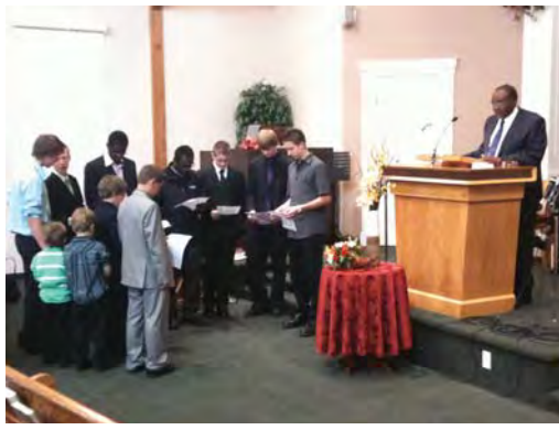
Leduc Church young men participated in a special dedication service for them.