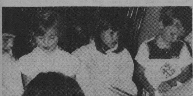
Children from Okotoks Vacation Bible School.