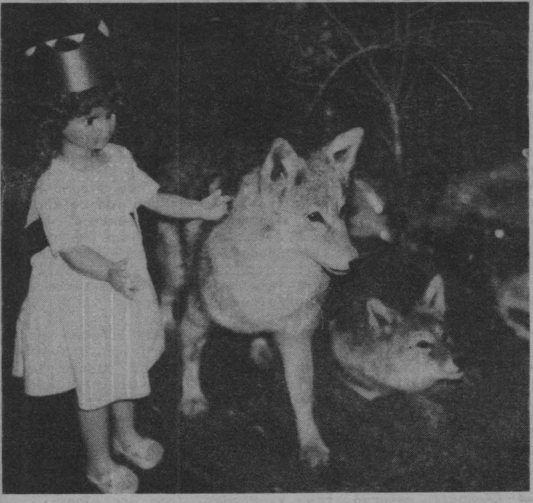
Part of the Sherwood Park VBS display.

Sponsored by Alberta Conference Sabbath School Department