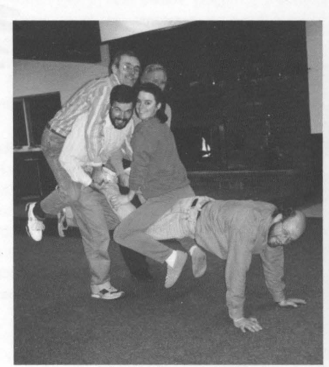
Teachers learn new games to share with students.