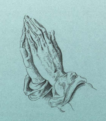
Remember January 7 is "The Day of Prayer"

If my people, which are called by my name, shall humble themselves, and pray, and seek my face, and turn from their wicked ways; then will I hear from heaven, and will forgive their sin, and will heal their land.