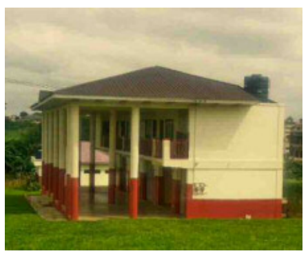
Dutch Building for Deaf Emphasis