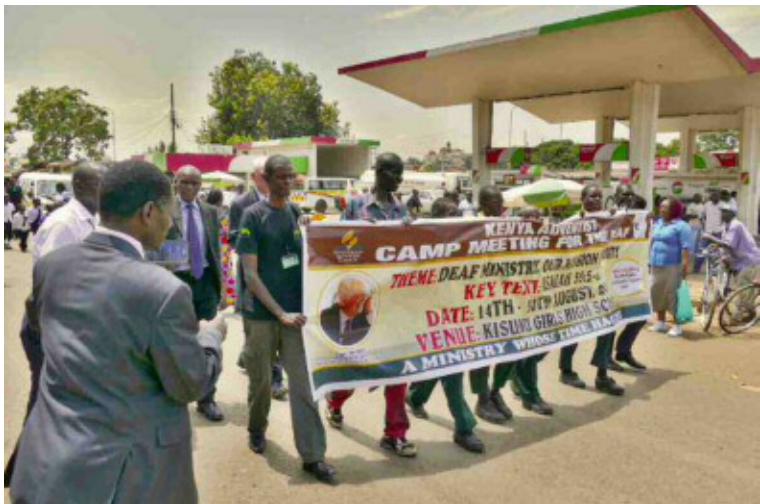
Enthusiastic Signed Singing at the Kenya Camp Meeting for the Deaf | The Downtown Parade at the Deaf Camp