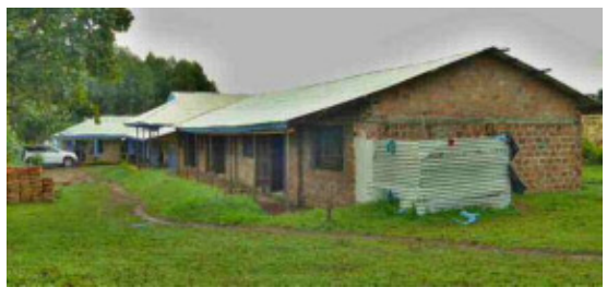
The school with new section in Aug.

They have four teachers and teacher's helpers, a cook and two men to help, look after the boys and the grounds.