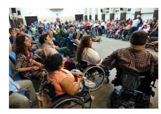
Romania "Special Needs Group"