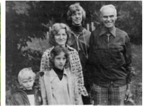
Canadian Deaf about 35-40 years ago