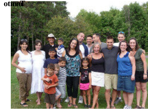
Toronto, Canada - Deaf Ministry