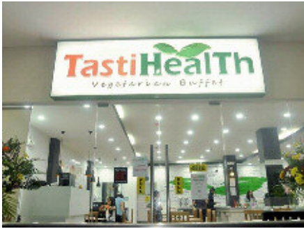
The new “TastiHealth” vegetarian restaurant providing employment for Deaf near one of our Philippine Universities.