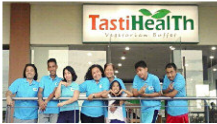
Staff from the restaurant that specializes in Healthy foods