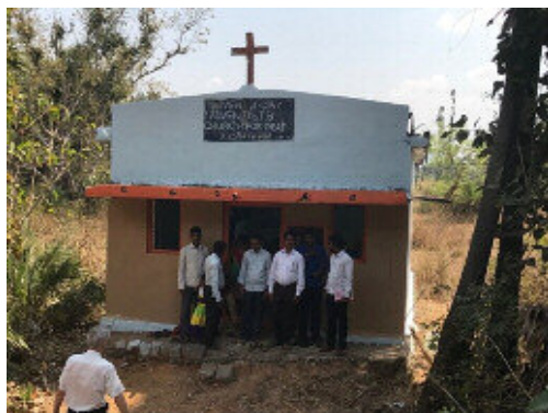
The little Deaf Church where the group met on Sabbath

Church, which is located about 10 kilometers from the Blind School. A Deaf GO worker is currently in charge of the Deaf congregation. I was told that India has about 6 or 7 Adventist churches just for the Deaf. To God be praised!