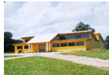
CDC School at Ark. Alpena about 1985