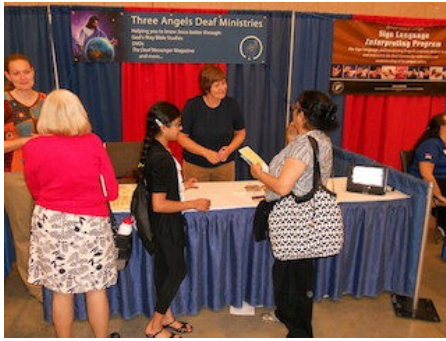
3ADM Booth at a Deaf Convention