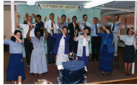
Signing a Special at Milo Meeting