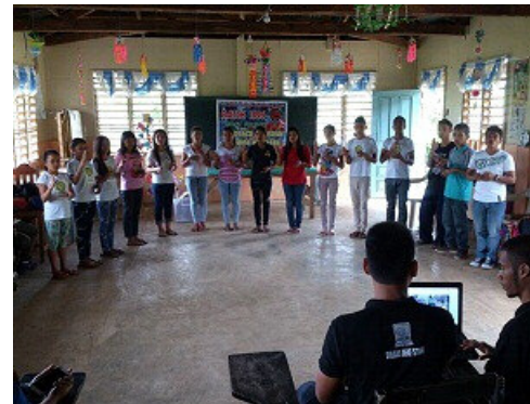
Students sign singing in the classroom

There was a 'ground breaking' ceremony for this new building back in 2015. It has taken a lot of work, but this March 2017 many church leaders and others gathered for the official opening of the new dormitory. It is so much better than what was observed for the boys back in 2015 when the 'dorm' floor was made of dirt and chickens were sharing the same building!