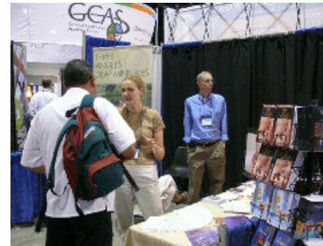
3ADM General Conference Booth