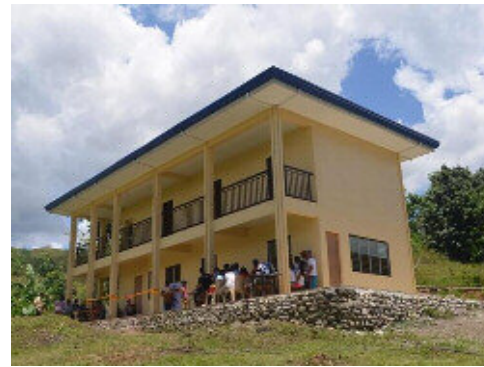
Opening of New Dorm at the SULADS Philippine Deaf School

For Easy English Books & Signed DVD's for Deaf- Go to the Three Angel's Deaf Ministries web site: www.3adm.org