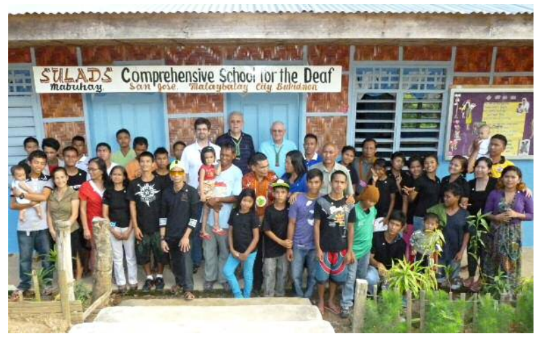
The new SULADS - SDA school for the Deaf is bursting the seams with students. Shown here are the students, teachers/helpers and visitors in Feb.

Featuring SDA Deaf Ministry in Canada and Overseas In Conjunction With Gospel Outreach May, 2015