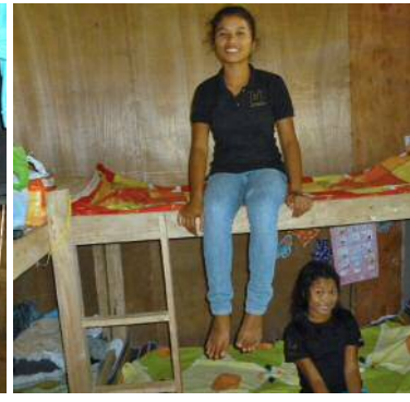
[Left] the boys dorm is an original dirt floor building, now a dorm and barn. [Right] the girls have better rooms with a concrete floor, but very crowded

funding for transportation. The two volunteer helping couples, each with a child under one, are being adopted as Gospel Outreach workers - one sponsorship for each couple. There are several other volunteers that only basically receive board and a very humble room.