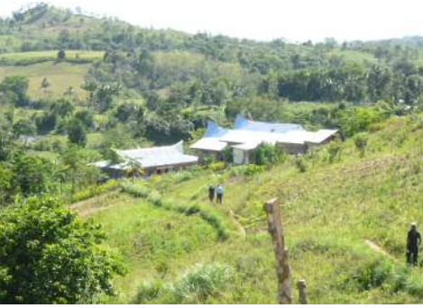
[Left] At the foot of the mountain, you see a little white set of buildings- then [Right] a closer view of the Administration building, the dorm, kitchen & washroom. The water reservoir tank is beside from where this picture was taken.