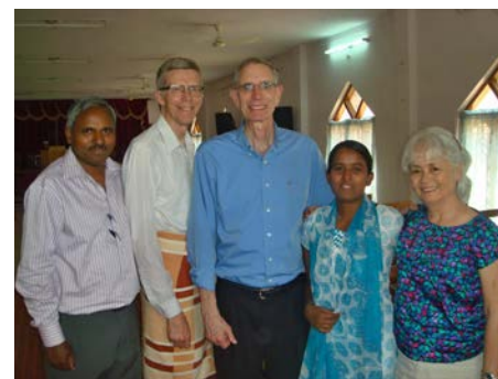
Baptism of the 1 st (former) student from the Asian Aid Deaf School, March 2/13 (2 nd R) It was a big step for a girl, coming from a Hindu home. She is now a seamstress with her own business in the nearby town!