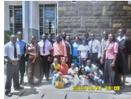
Nairobi, Kenya, Deaf Congregation