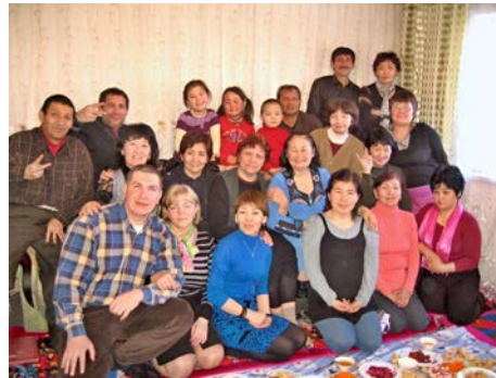
New Year's Party with Bishkek Deaf