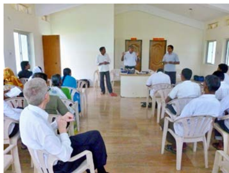
The GO Deaf Ministry workers 4 day training session held Feb. 20-23 in India