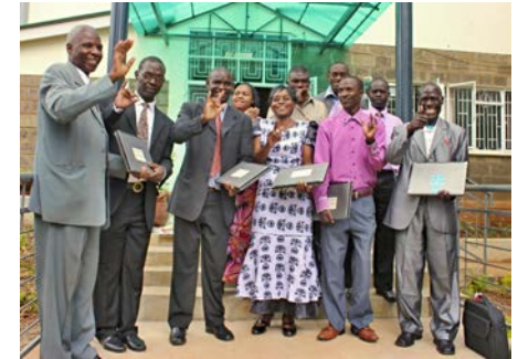
Exited GO workers supplied with laptop computers in Kenya via kindness of the General Conference

Gospel Outreach has started a new plan called "Adopt-A-Worker" . It works by allowing a specific family, Sabbath School class or Church to sponsor one GO worker and then get a report every three months as to how things are going.