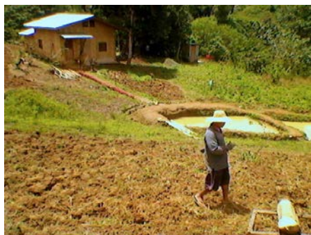
Working the fields for growing vegetables at the new SULADS deaf school. The building shown was the first completed and is for the workers to stay in while building