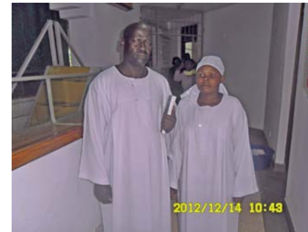
Baptism of Deaf Couple, Nairobi