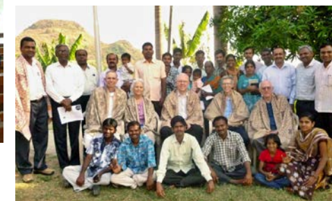
The Gospel Outreach Training Deaf Group with Conference Leaders at the Bobboli Blind School, Feb. 26, 2013