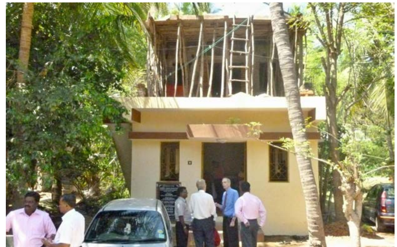
Opening of New Deaf Church at Pattakottai, South India