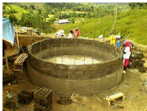
The water reservoir being built for the new campus of the SULADS Deaf school in Mindanao, Philippines. Down the hill you can just barely see the administration building now basically completed