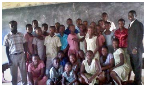
Jamasi Ghana Deaf School Church Group Started meeting on Sabbaths