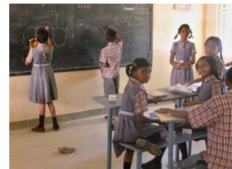
Deaf Students at the Asia Aid Deaf school in India. Students come from the villages where they probably would get little or no formal education. They start as young as age 4 and continue to 20+. We loved them!