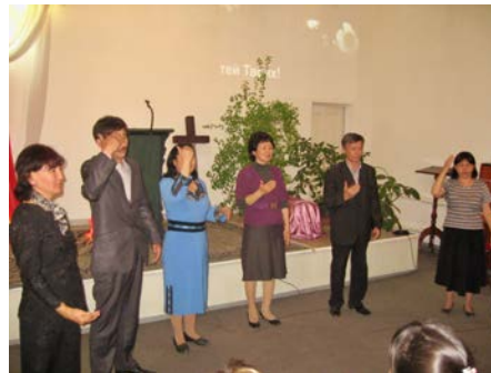
Worship Time in Bishkek