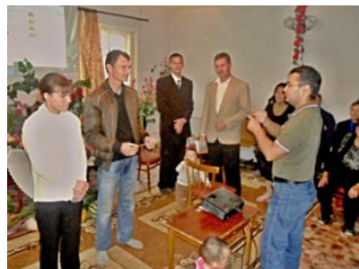
Deaf Meeting in Oralsk