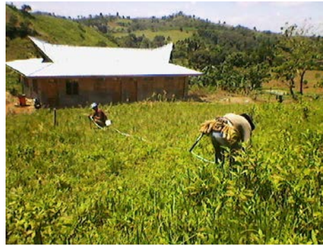
(L)The New Dormitory and the (R)Administration Building at the Mindanao Deaf School