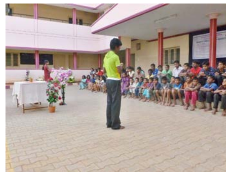
Two Student leaders at the SDA Asian Aid school for the Deaf lead out in opening exercises outdoors in the courtyard