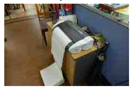
A braille printer in use in SDA blind ministry work in Korea

unnoticed by heaven. Indeed it is a "calling" we must not ignore and I am pleased to report that the world field has become very receptive to this ministry. We have much to do and no one person, church or division can do it by themselves.