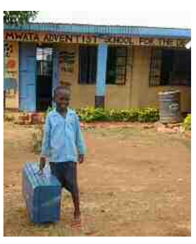
A new deaf student arrives at the Mwata SDA School for the Deaf in Western Kenya with the metal box holding his possessions

So, we work and pray and share the news, as God open's the doors!