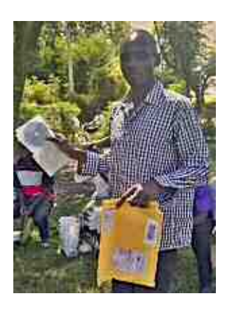
A deaf person from Kenya showing the DVD's sent free for their local group!

-A Camp meeting for the Deaf will also be held in Kenya, Ghana and Uganda, etc.