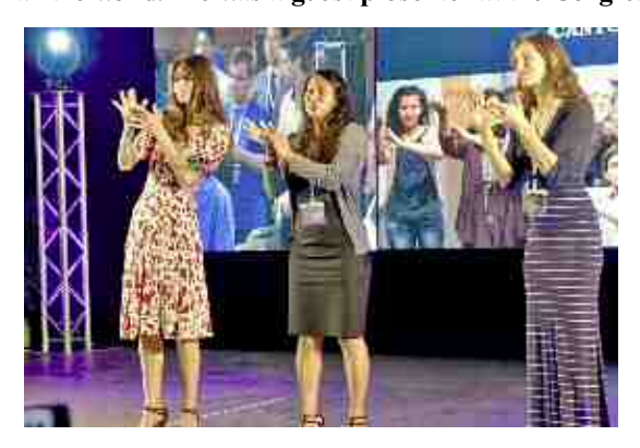
At the Spanish Deaf Congress