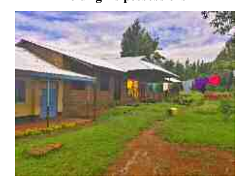
New Roof at the Mwata Kenya Deaf School - funds were recently sent toward the much needed windows and doors