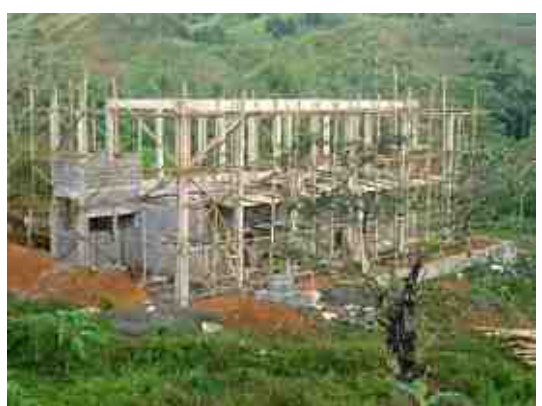
The latest picture we have of the new Dorm/Kitchen building being built at the Philippine Deaf school