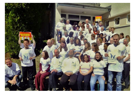
Group picture with the special T-Shirts showing the new General Conference Deaf Logo - see opposite page for larger view

←←OTHER PAGE PICTURE CAPTION- A View of the area in Germany where the 95th was held as viewed from the retreat center