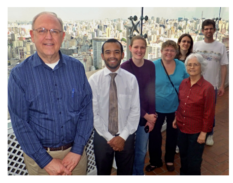
The group of deaf ministry leaders and interpreters from the USA who met with 170 leaders and deaf members from Brazil during a special seminar there