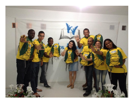
Enthusiastic members of the Deaf group in Brazil with their deaf imprinted clothing and Logo