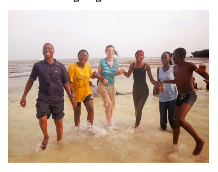
Having fun in December at the beach!