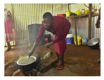
Cooking for the deaf students

Over $10,000 has already been sent from Canada to help build this needy school. It is receiving excellent support from the Conference level!