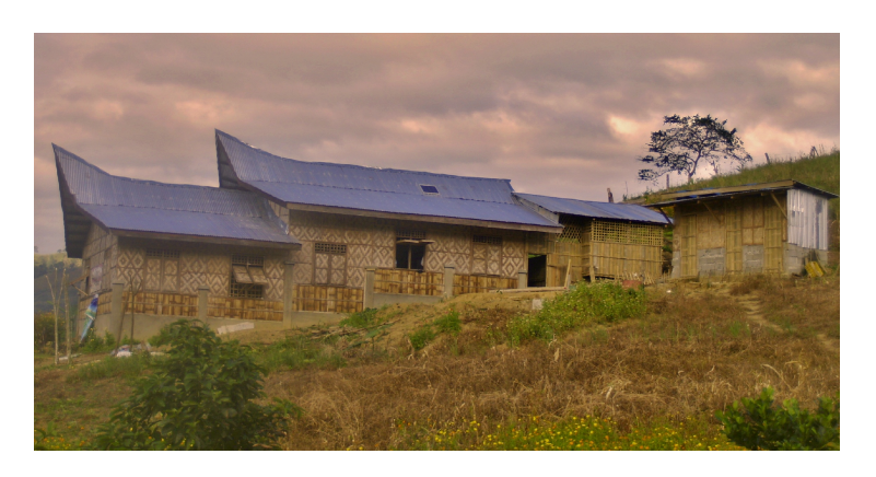
Mindanao Deaf School Residence, Kitchen and Latrine kind.

Many more churches we visited gave whatever they have in