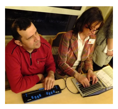
An Electronic Braille system being used by the man who was both deaf & blind during the German 95 Deaf Anniversary