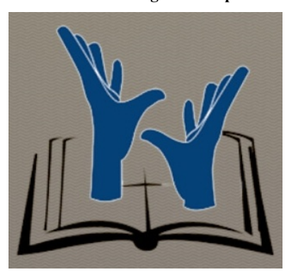
The new General Conference Deaf Logo reflecting open 'signing hands' pointed toward Heaven and on the Bible