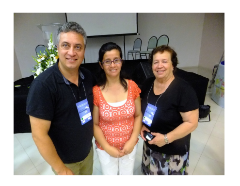
A Deaf family from Chile who drove for several days to attend the special Deaf Seminar weekend in Brazil